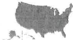
East and West Regions